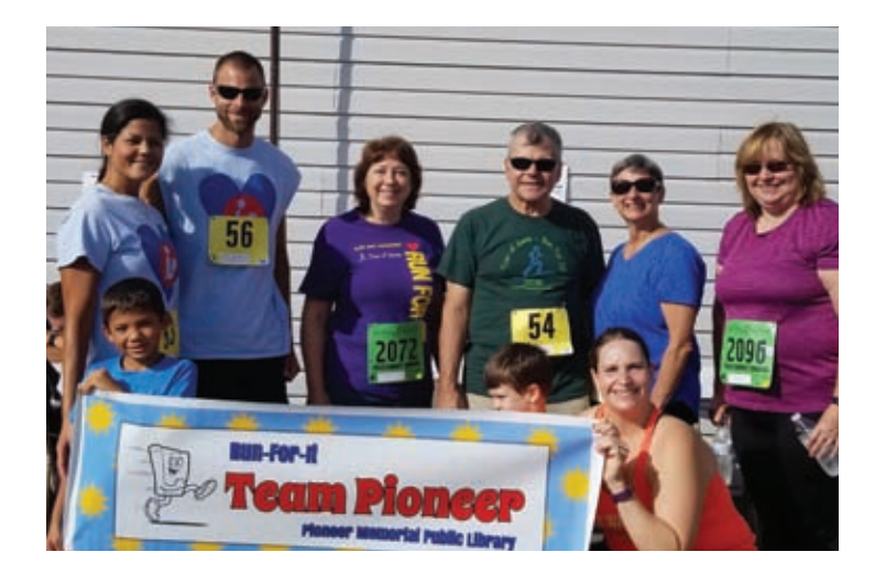
Pioneer Memorial Public Library in Harman is one of several libraries, along with Belington Public Library and Tygart Valley Community Library , that uses money raised from Run For It to support programs and cover basic operating costs.

In the past several years, the funds helped pay for a portion of the roof to be replaced and to replace heating and air-conditioning units that were more than 25 years old. This summer, the library is looking to upgrade its electrical systems.