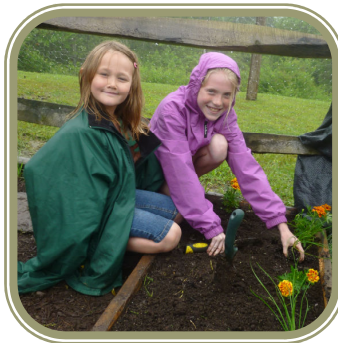
4 th grade gardeners mentored the 1 st graders in transplanting

Clements at the Garden Club during the summer. Parents and incoming kindergarteners also participated.